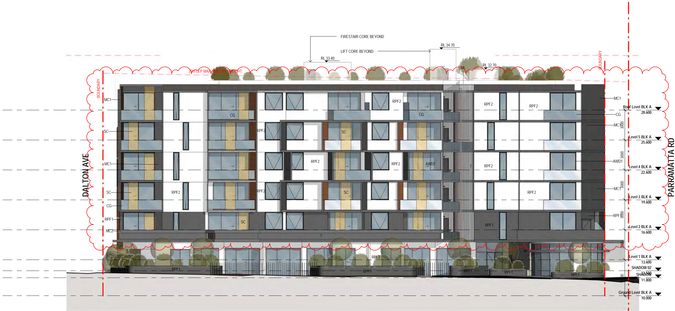
E1 EAST SOUTH ELEVATION-SMALLWOOD AVENUE ELEVATION 1 : 200

REFERENCES DRAWINGS TO BE READ IN CONJUNCTION WITH BUT NOT LIMITED TO ALL STRUCTURAL ENGINEERS, STORMWATER ENGINEERS, LANDSCAPE ARCHITECTS, AND OTHER ASSOCIATED PLANS & REPORTS REFER TO THE BASIS REPORT FOR ADDITIONAL REQUIREMENTS TO THE ONES NOTED ON THE DRAWINGS. NOTES ALL DIMENSIONS AND SETOUTS ARE TO BE VERIFIED ON SITE AND ALL OMISSIONS OR ANY DISCREPANCIES TO BE NOTIFIED TO THE ARCHITECT. FIGURED DIMENSIONS TO BE USED AT ALL TIME. DO NOT SCALE MEASUREMENTS OFF DRAWINGS.