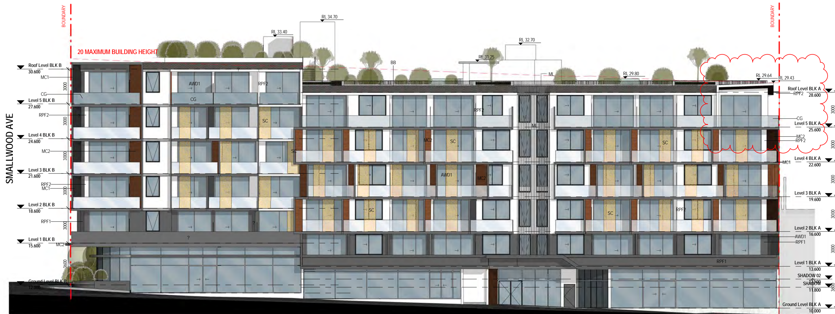
1 : 200

OUTLINE OF PROPOSED 222-238 PARRAMATTA ROAD WAREHOUSE BUILDING DA2016/106